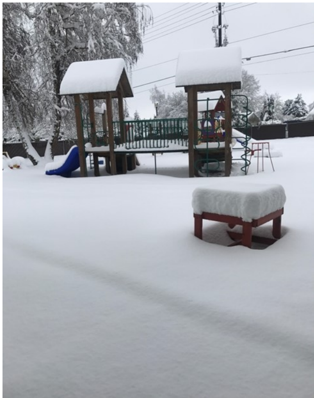
Picture of our playground taken on January 11, 2017

Saturday, February 11 th , we will be having a Preschool Open House from 10 am -2 pm. If you know of any new families wanting to enroll their child/children for the fall of 2017 please pass this information on. We will be starting Preschool Registration for returning families February 10th and on March 1 st for new families interested in enrolling in the fall of 2017.